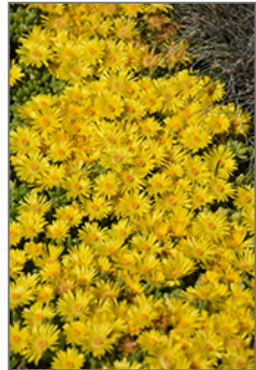
Yellow Ice Plant flowers