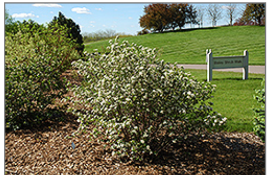
Autumn Magic Black Chokeberry in bloom