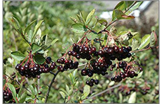
Autumn Magic Black Chokeberry fruit

This shrub performs well in both full sun and full shade. It is an amazingly adaptable plant, tolerating both dry conditions and even some standing water. It is not particular as to soil pH, but grows best in clay soils, and is able to handle environmental salt. It is somewhat tolerant of urban pollution. This is a selection of a native North American species.