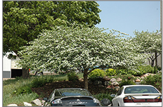
Thornless Cockspur Hawthorn in bloom