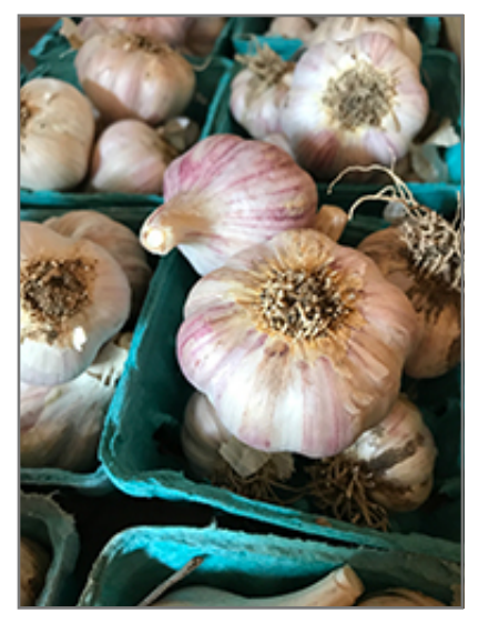
Siberian Garlic fruit