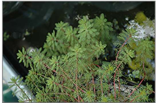
Red Stemmed Parrot Feather foliage