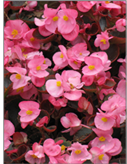
Bada Boom Pink Begonia flowers

Bada Boom Pink Begonia is recommended for the following landscape applications;