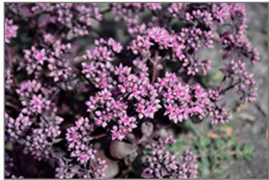
Red Carpet Stonecrop flowers