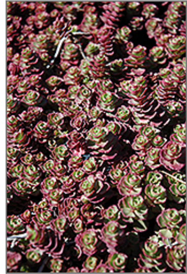
Red Carpet Stonecrop foliage Photo courtesy of NetPS Plant Finder

This plant will require occasional maintenance and upkeep, and is best cleaned up in early spring before it resumes active growth for the season. Deer don't particularly care for this plant and will usually leave it alone in favor of tastier treats. Gardeners should be aware of the following characteristic(s) that may warrant special consideration;