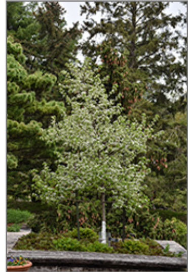
Korean Sun Pear in bloom