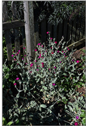
Rose Campion in bloom