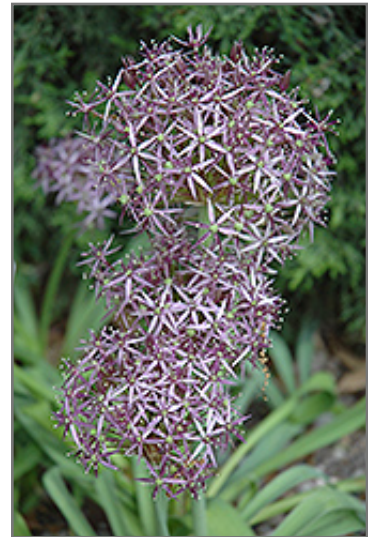
Star Of Persia Onion flowers