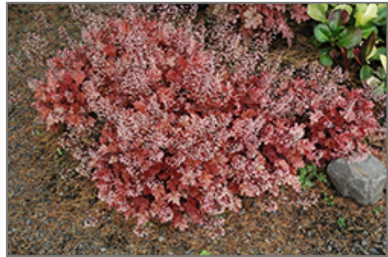
Peach Crisp Coral Bells in bloom

Peach Crisp Coral Bells is recommended for the following landscape applications;