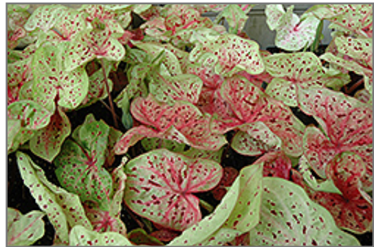
Miss Muffet Caladium foliage