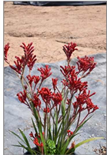
Kanga Red Kangaroo Paw in bloom