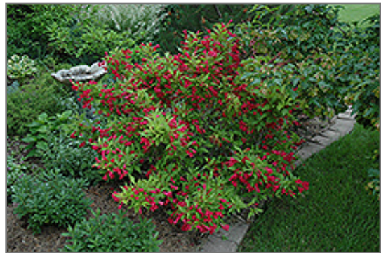
Red Prince Weigela in bloom