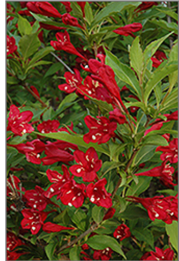
Red Prince Weigela flowers