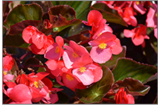
Whopper Rose with Bronze Leaf Begonia flowers

Whopper Rose with Bronze Leaf Begonia is recommended for the following landscape applications;