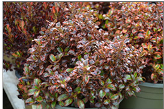
Tequila Sunrise Mirror Bush