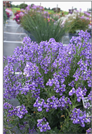
Bluebird Nemesia flowers