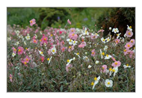
Common Rock Rose in bloom

Common Rock Rose is recommended for the following landscape applications;