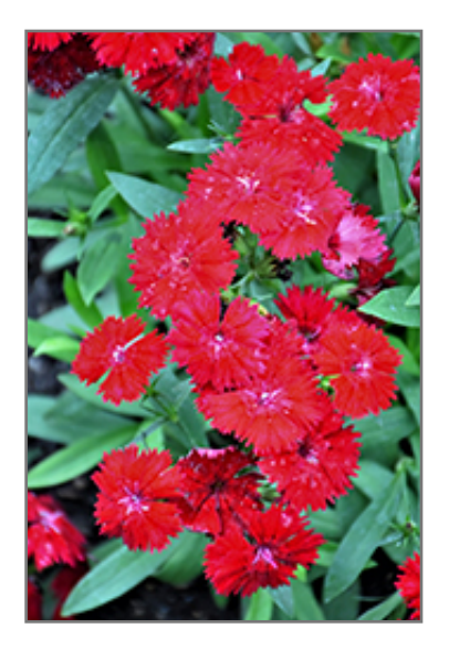
Telstar Crimson Pinks flowers

Telstar Crimson Pinks is an herbaceous evergreen perennial with a mounded form. It brings an extremely fine and delicate texture to the garden composition and should be used to full effect.