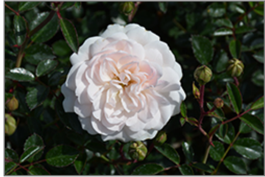
Sea Foam Rose flowers