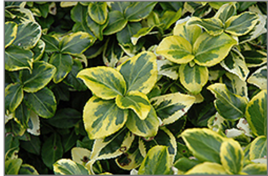
Gold Prince Wintercreeper foliage