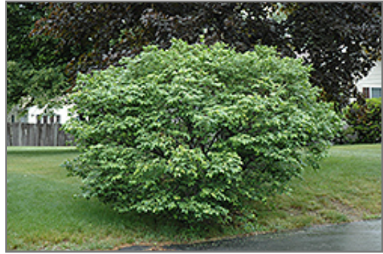
Compact Winged Burning Bush

This shrub does best in full sun to partial shade. It prefers to grow in average to dry locations, and dislikes excessive moisture. It is not particular as to soil type or pH. It is highly tolerant of urban pollution and will even thrive in inner city environments. This is a selected variety of a species not originally from North America.