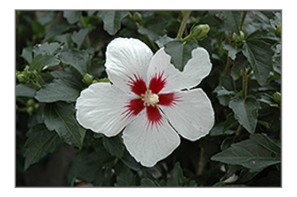
Lil' Kim Rose of Sharon flowers

7711 S. Parker Road Centennial, CO 80016 303.690.4722 www.tagawagardens.com