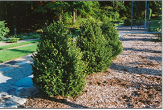
Green Mountain Boxwood

Green Mountain Boxwood is recommended for the following landscape applications;