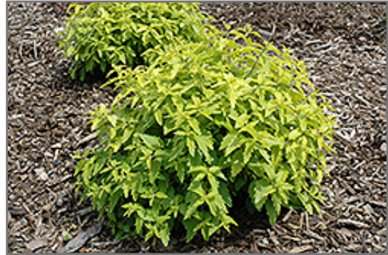
Sunshine Blue Caryopteris