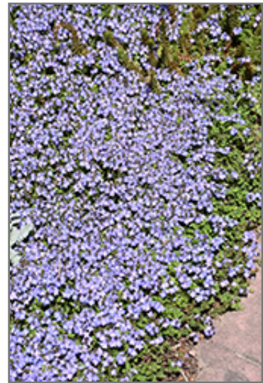
Crystal River Speedwell in bloom