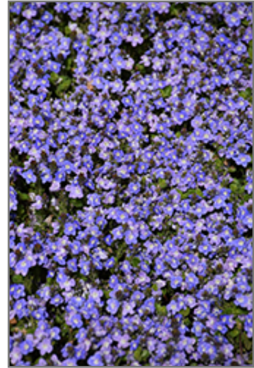
Crystal River Speedwell flowers