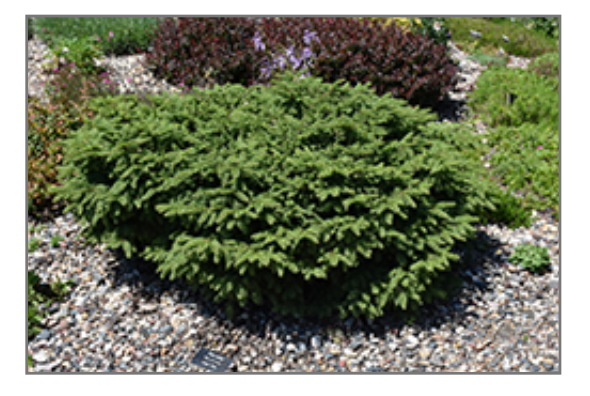
Elegans Spruce

This shrub does best in partial shade to shade. It does best in average to evenly moist conditions, but will not tolerate standing water. It is not particular as to soil type or pH, and is able to handle environmental salt. It is highly tolerant of urban pollution and will even thrive in inner city environments. Consider applying a thick mulch around the root zone in winter to protect it in exposed locations or colder microclimates. This is a selected variety of a species not originally from North America.