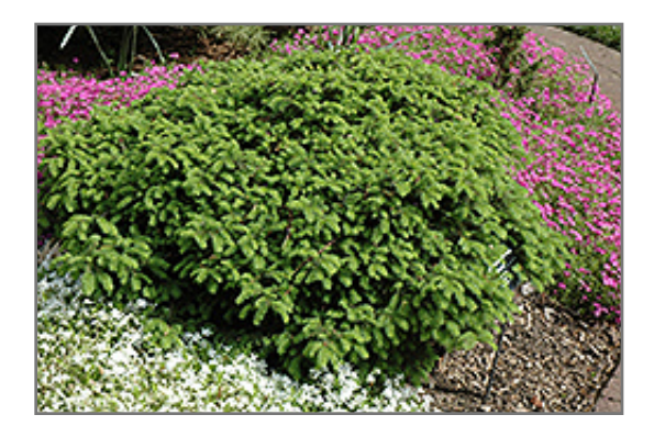
Elegans Spruce

7711 S. Parker Road Centennial, CO 80016 303.690.4722 www.tagawagardens.com