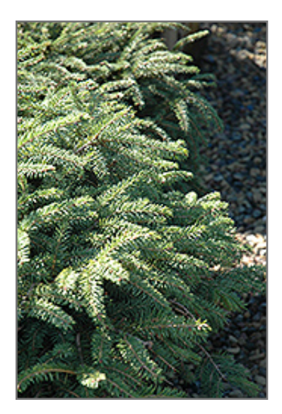
Elegans Spruce foliage