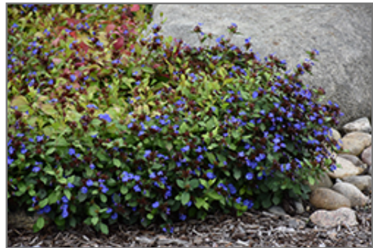
Plumbago in bloom