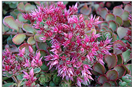
Fuldaglut Stonecrop flowers