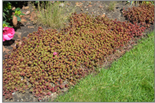
Fuldaglut Stonecrop

Fuldaglut Stonecrop is a fine choice for the garden, but it is also a good selection for planting in outdoor pots and containers. Because of its spreading habit of growth, it is ideally suited for use as a 'spiller' in the 'spiller-thriller-filler' container combination; plant it near the edges where it can spill gracefully over the pot. Note that when growing plants in outdoor containers and baskets, they may require more frequent waterings than they would in the yard or garden.