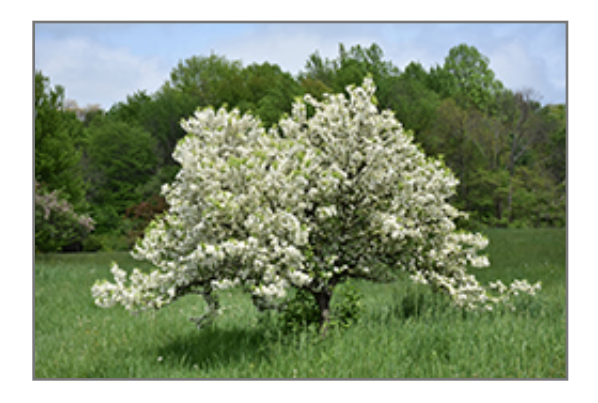
Lollipop Flowering Crab in bloom

7711 S. Parker Road Centennial, CO 80016 303.690.4722 www.tagawagardens.com