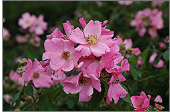
Polar Joy Rose flowers