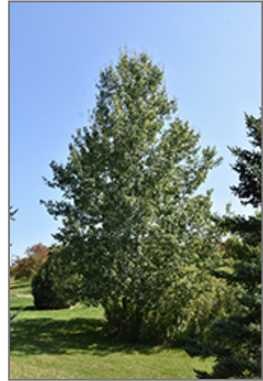
Trembling Aspen