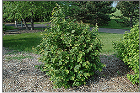
Beaked Hazelnut

Beaked Hazelnut will grow to be about 8 feet tall at maturity, with a spread of 7 feet. It tends to be a little leggy, with a typical clearance of 2 feet from the ground, and is suitable for planting under power lines. It grows at a medium rate, and under ideal conditions can be expected to live for approximately 30 years. While it is considered to be somewhat self-pollinating, it tends to set heavier quantities of fruit with a different variety of the same species growing nearby.