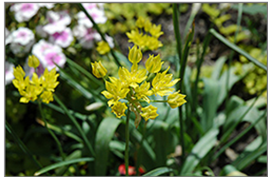
Golden Garlic flowers