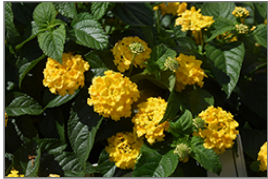
Lucky Yellow Lantana flowers