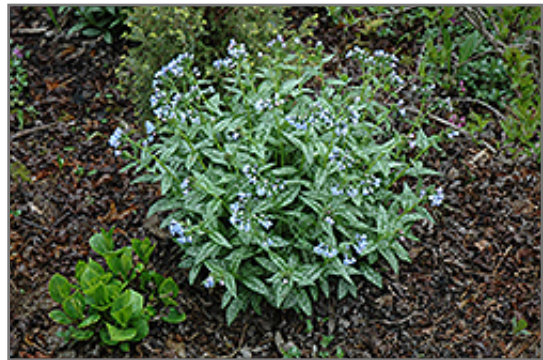
Roy Davidson Lungwort in bloom