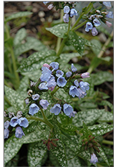
Roy Davidson Lungwort flowers