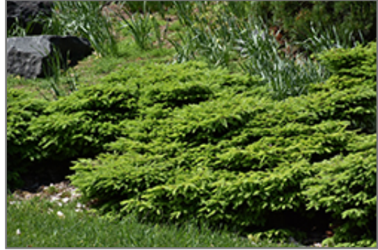
Little Gem Spruce

Morning sun only in Colorado. Will burn in midday or afternoon sun.