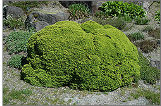
Little Gem Spruce