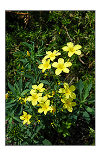
Dwarf Perennial Flax flowers

Dwarf Perennial Flax will grow to be about 12 inches tall at maturity, with a spread of 12 inches. When grown in masses or used as a bedding plant, individual plants should be spaced approximately 8 inches apart. It grows at a fast rate, and under ideal conditions can be expected to live for approximately 3 years. As an herbaceous perennial, this plant will usually die back to the crown each winter, and will regrow from the base each spring. Be careful not to disturb the crown in late winter when it may not be readily seen!