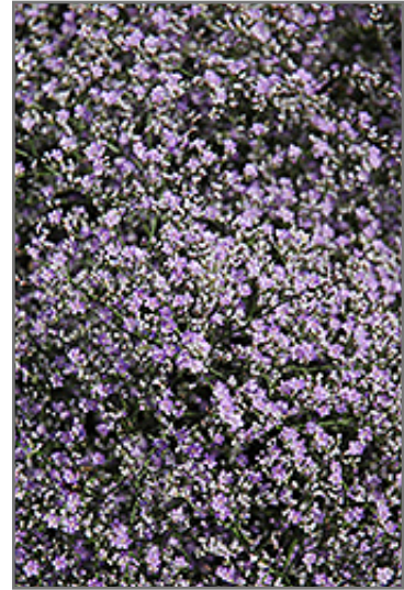
Sea Lavender flowers