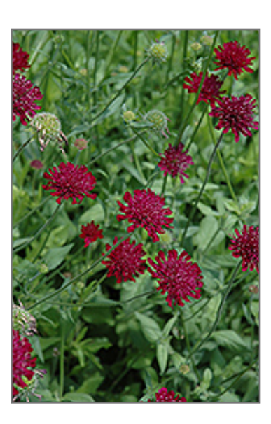
Crimson Scabious flowers

This plant does best in full sun to partial shade. It prefers to grow in average to dry locations, and dislikes excessive moisture. It is not particular as to soil type, but has a definite preference for alkaline soils. It is somewhat tolerant of urban pollution. This species is not originally from North America.