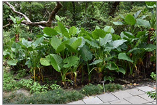
Calidora Elephant's Ear