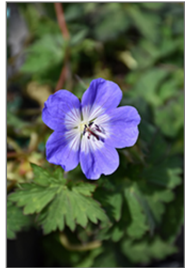
Azure Rush Cranesbill flowers

Azure Rush Cranesbill is recommended for the following landscape applications;