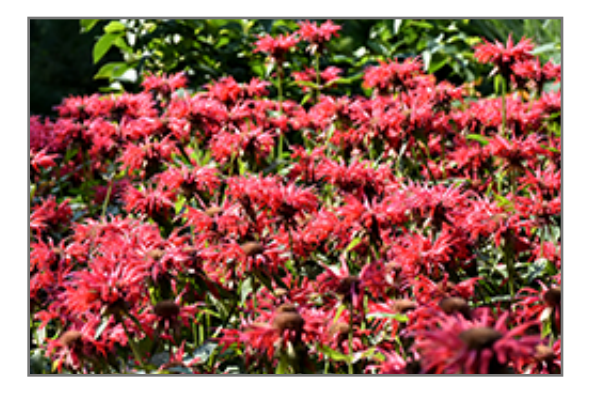
Gardenview Scarlet Beebalm flowers

7711 S. Parker Road Centennial, CO 80016 303.690.4722 www.tagawagardens.com