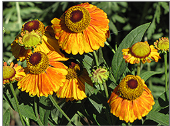
Mardi Gras Sneezweed flowers

Mardi Gras Sneezweed is recommended for the following landscape applications;