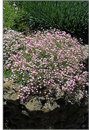
Pink Creeping Baby's Breath in bloom

Pink Creeping Baby's Breath will grow to be only 6 inches tall at maturity, with a spread of 18 inches. Its foliage tends to remain low and dense right to the ground. It grows at a fast rate, and under ideal conditions can be expected to live for approximately 10 years. As an herbaceous perennial, this plant will usually die back to the crown each winter, and will regrow from the base each spring. Be careful not to disturb the crown in late winter when it may not be readily seen!