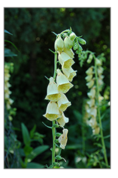
Yellow Foxglove flowers