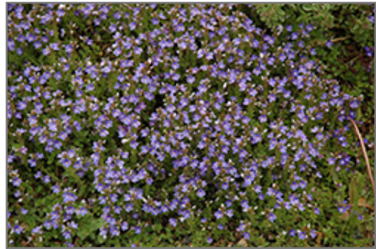
Turkish Speedwell in bloom

Turkish Speedwell is recommended for the following landscape applications;