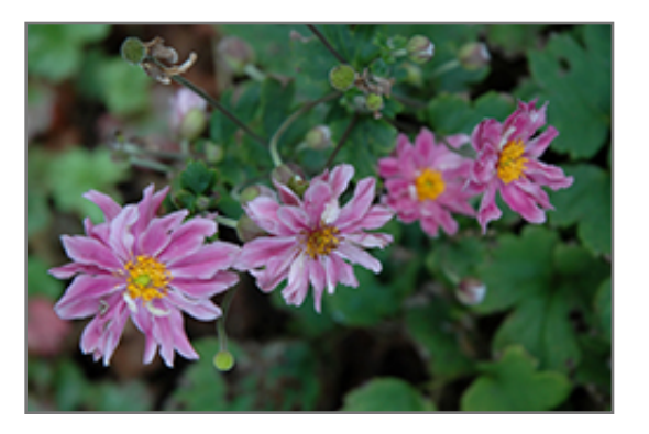
Pretty Lady Emily Anemone flowers

7711 S. Parker Road Centennial, CO 80016 303.690.4722 www.tagawagardens.com