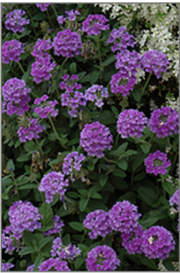
EnduraScape Blue Verbena flowers

7711 S. Parker Road Centennial, CO 80016 303.690.4722 www.tagawagardens.com