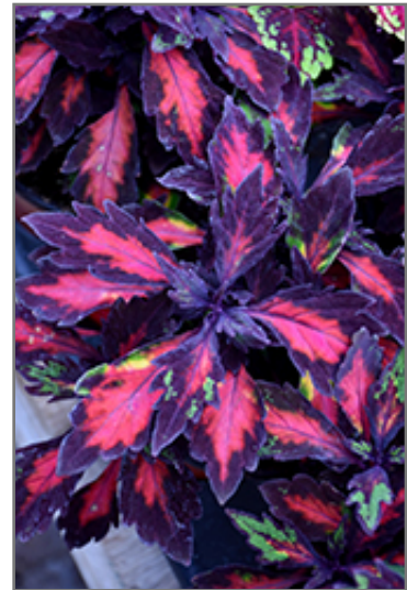
Marquee Special Effects Coleus foliage

Marquee Special Effects Coleus is recommended for the following landscape applications;